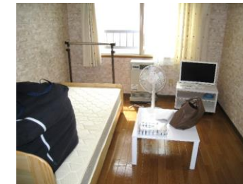
※Photos are from room 202.