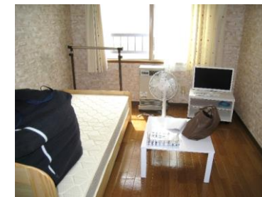
※Photos are from room 202.